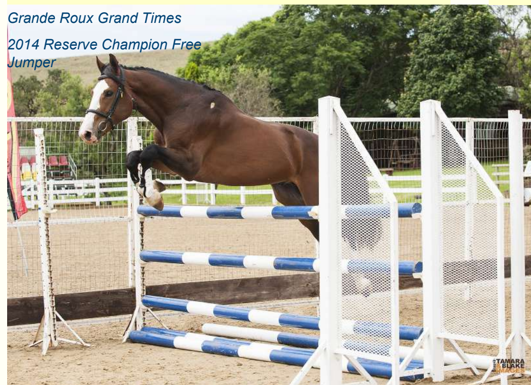
Grande Roux Grand Times 2014 Reserve Champion Free Jumper