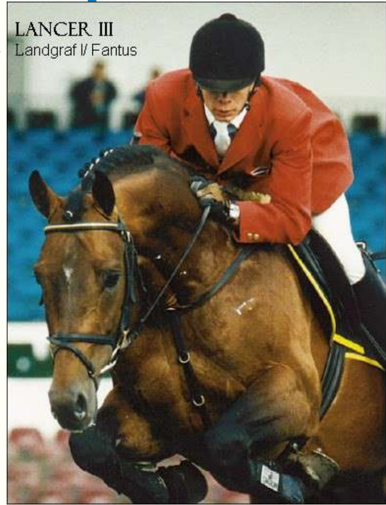
LANCER III Landgraf I/ Fantus

ADELA WARMBLOOD STUD Breeding best blood choices for success Contact Maxine Oosthuizen (abmax@mweb.co.za)