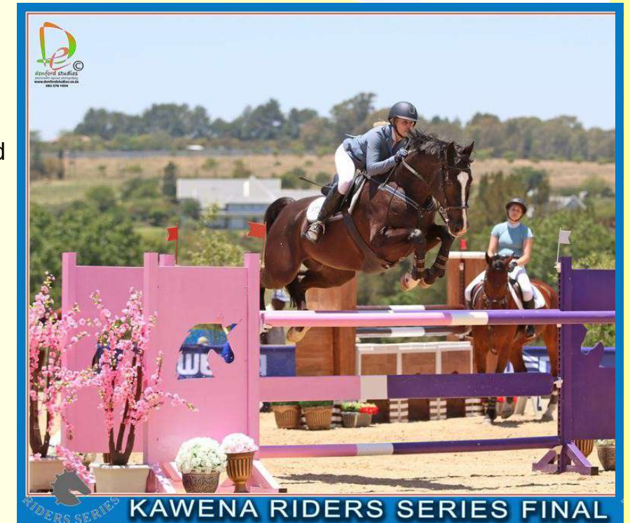
Below Callaho Fiorella & Top right: Callaho Lexington Below right: Callaho Loki