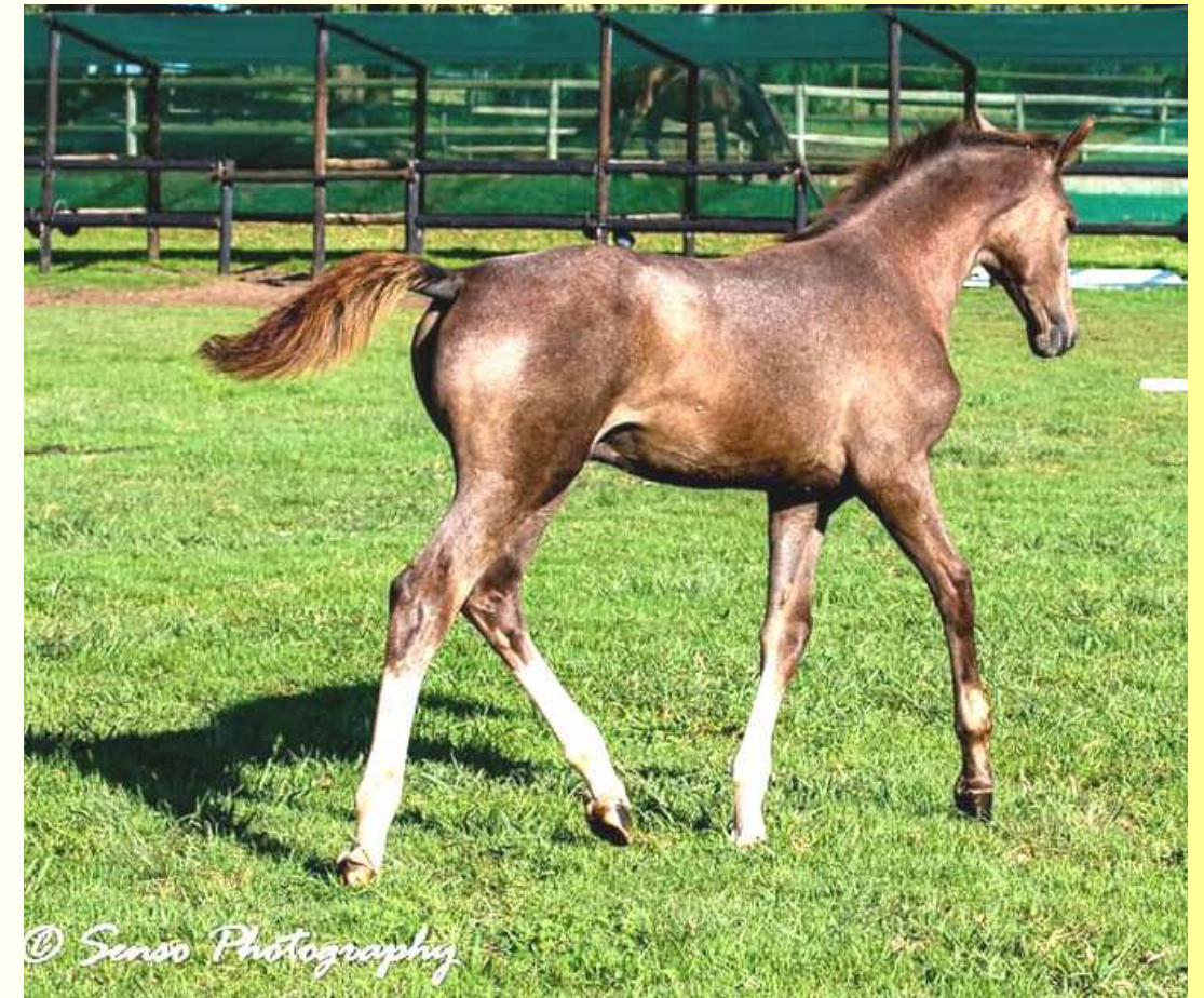
Left: Rivervale colt by I'm All Yours ( I'm Special de Muze/ Emerald/ Diamant de Semilly ) out of Rivervale Certainty ( Capriccio/ Mayfair Wunderbar )