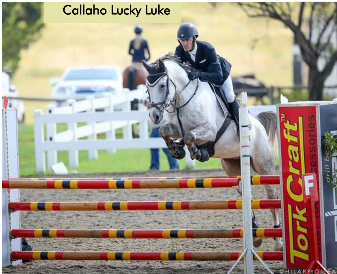
Callaho Lucky Luke