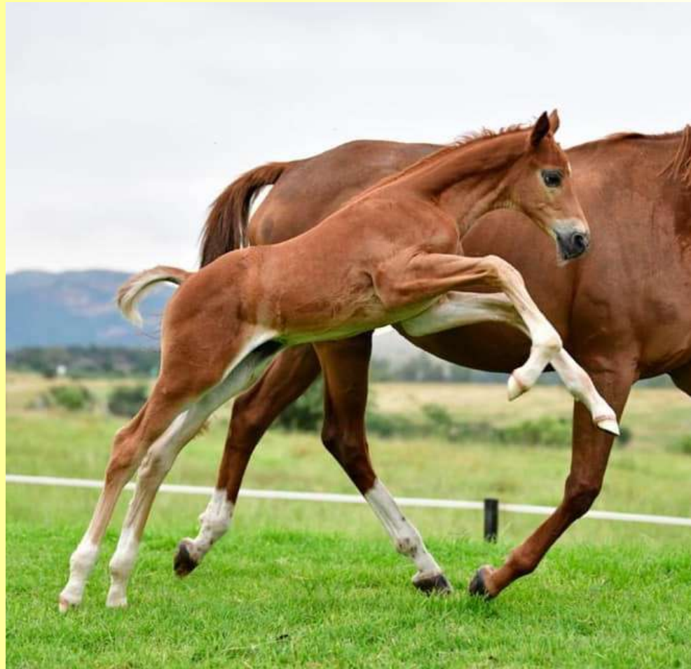
Right: Martini Ever Scott by Elvis ter Putte ( Diamant de Semilly/ Darco ) out of Callaho For Scotty ( For Joy/ Crown Collection xx )