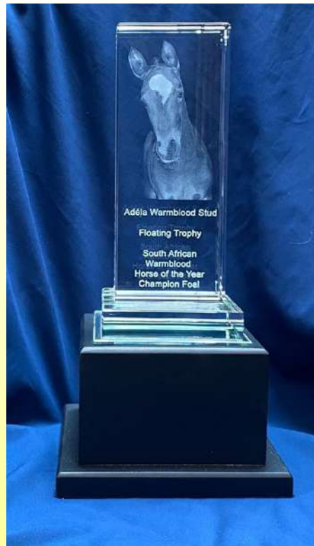
Below right: Glenwood Escada